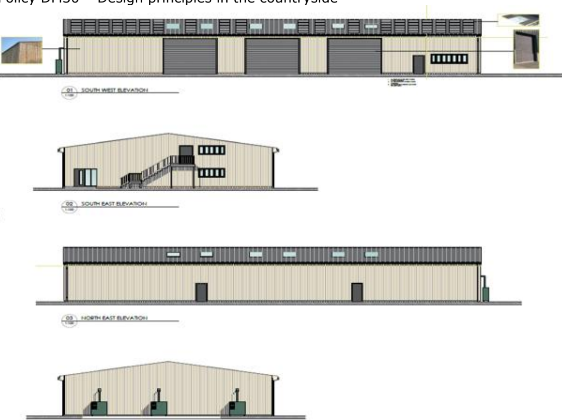
<u>Proposed elevations for current application under ref: 23/502511/FULL (no change from application refused under reference 21/502548/FULL and dismissed at appeal)</u>

Policy DM30 - Design principles in the countryside